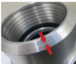
Identification band machined into tail indicates coupling has a square section washer in the internal ferrule, no identification band indicates an O ring in the internal ferrule.