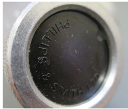
Branded pull knob disc