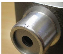
Female coupling after August 2016 will have a small ridge on both lugs of the coupling not visible with pull knobs in place