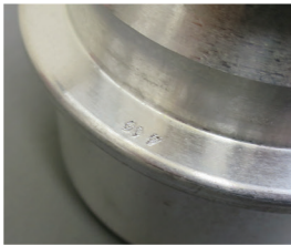
Date of manufacture after successful testing