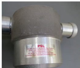
Machined tail - as cast body. Crosshatch knurl on pull knob. (Competition has straight knurl)