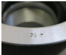
Date of manufacture after successful testing