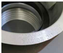
STD cert mark. Unique licence no