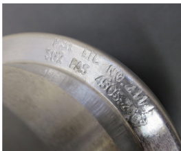
STDS cert mark. Unique licence no